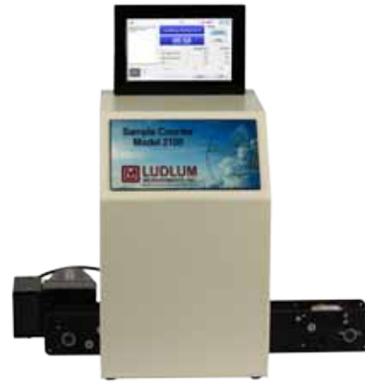
Part Number: 48-3780

One rear panel mounted USB port enables connection to either a keyboard or barcode reader device for the purpose of entering sample ID's.